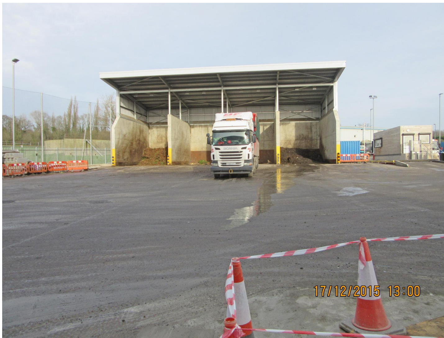
Figure 1 : Looking north showing the twin 400W floodlights and the PIR light on the weighbridge building